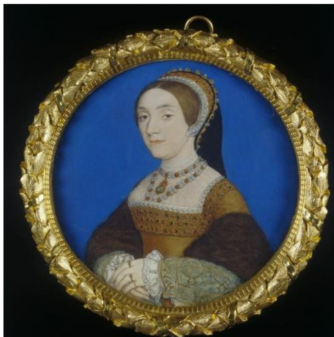
Fig 18 Portrait of a lady, perhaps Katherine Howard c.1540, Hans Holbein

When a second miniature, was first recorded in the Royal Collection in around 1837, it was also described as Henry VIII's fifth queen. 21 (fig 18)