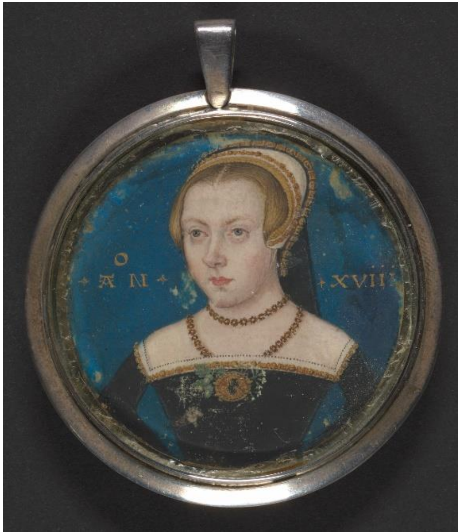
Fig 11 Unknown lady, possibly lady Jane Grey, c. 1546, Levina Teerlinc

A miniature portrait of a young woman in her 18 th year; Portrait of a Lady, Possibly Lady Jane Grey , c.1546 attributed to Levina Teerlinc at the Yale Center for British Art (ref B1974.2.59 ). (fig 11)