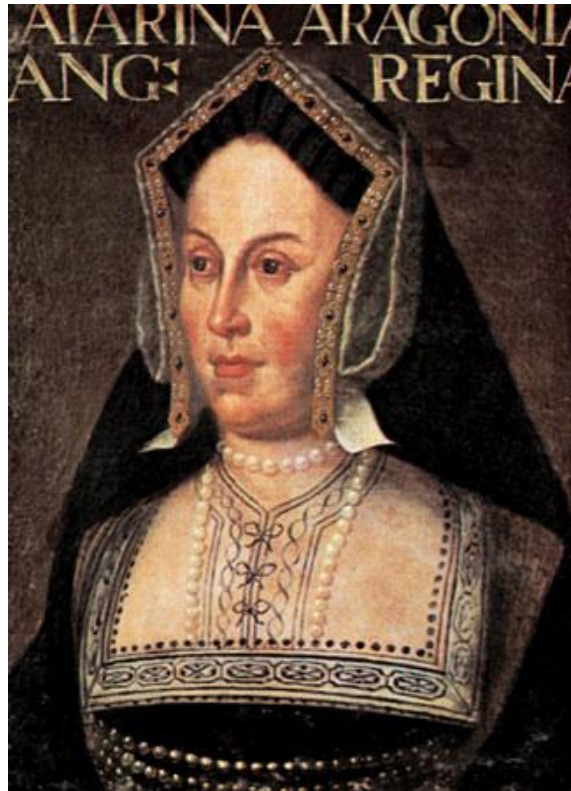
Fig 21 Katherine of Aragon, unknown artist