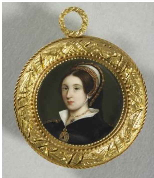
Fig 9 Portrait of a woman called Princess Mary, Duchess of Suffolk, William Essex, 1844

A miniature portrait based on the Hever portrait. (fig 8)