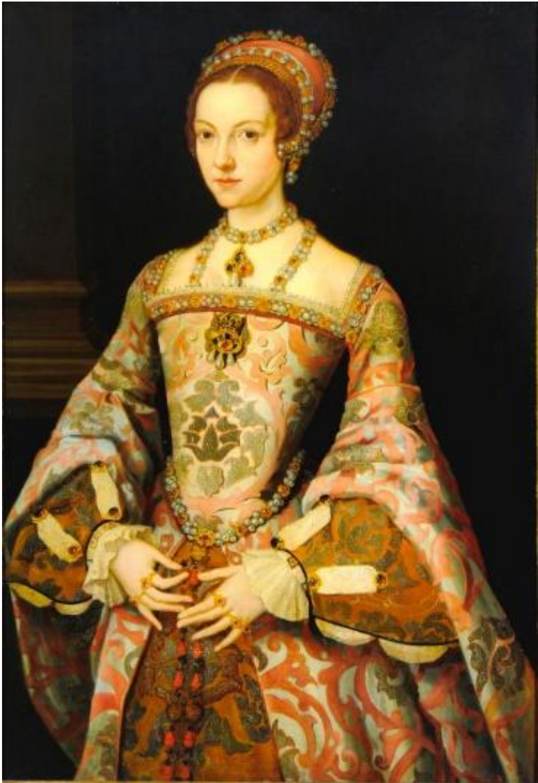
Fig 28 Queen Katherine Parr, The Hastings Portrait, undated, unknown artist

Here Katherine Parr is wearing an identical necklace. (fig 28)