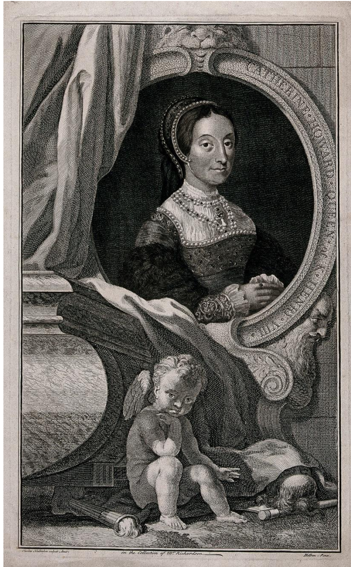
Fig 16 Catherine Howard, Queen of K. Henry VIII, c.1743-52, Jacobus Houbraken