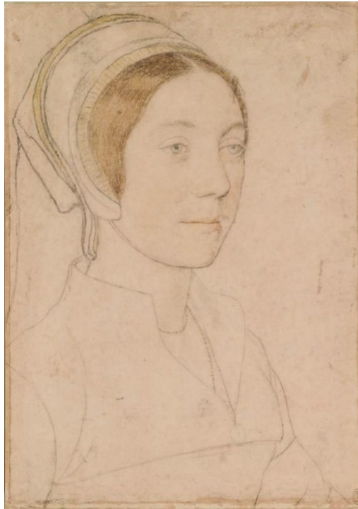
Fig 3 Unknown woman, c.1532-43, Hans Holbein

By the 19th century a drawing by Hans Holbein in the Royal Collection (ref. RCIN 912218 ), (fig 3) a later version of the drawing by Francesco Bartolozzi (ref. RCIN 680431 ) (fig 4) and a miniature portrait by Henry Pierce Bone that was based on these drawings were thought to depict Queen Katherine.