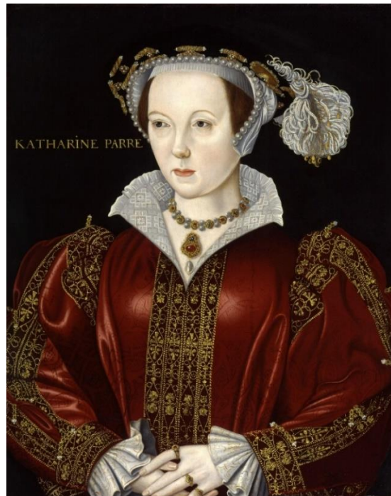
Fig 30 Katherine Parr, late 16th century, unknown artist

The pendant worn by Katherine Parr (figs 29, 30) is similar but not the same as that worn by Jane Seymour and Katherine Howard. (figs 13, 14 and 27) It may however be identified in an inventory of Katherine Howard's jewels compiled in 1542: 'one ouche of gold wherein is a fair pointed diamond and a fair ruby with a very fair pearl hanging at the same.' 27