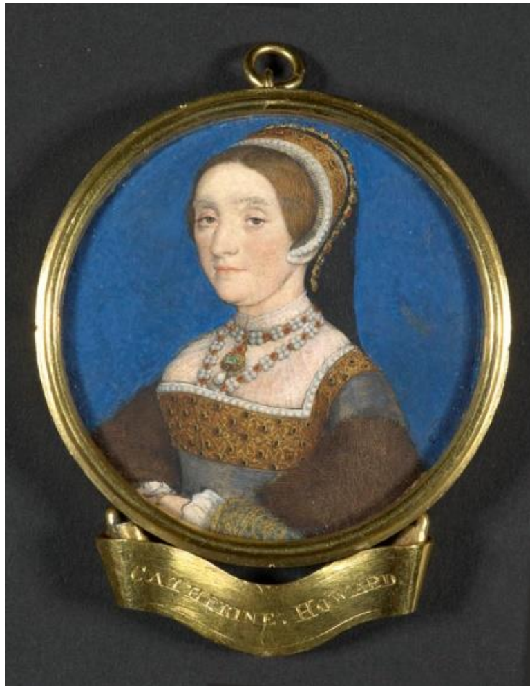
Fig 13 Portrait miniature of Katherine Howard, c.1540, Hans Holbein

There are two extant miniatures, each said to be the work of Hans Holbein. In each the sitter is wearing the same necklace (fig 26) and pendant (fig 27) as Jane Seymour. The first, Portrait Miniature of Katherine Howard , now in the collection of the Duke of Buccleuch and Queensberry (ref. Strawberry Hill ID: sh-000454 ), (fig 13) is known to have been in the possession of Thomas Howard, Earl of Arundel (1586-1646),