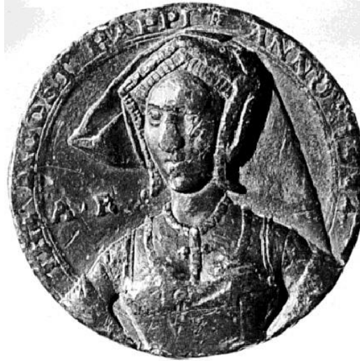
Fig 24 Anne Boleyn portrait medal, 1534