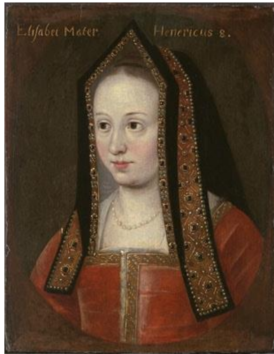
Fig 19 Elizabeth of York, unknown artist

Note the pattern on the jewelled band on her hood: squares comprising four pearls, (perhaps representing a four-leaf clover), alternating with gemstones set in gold on Elizabeth of York's hood. (figs 19, 20)