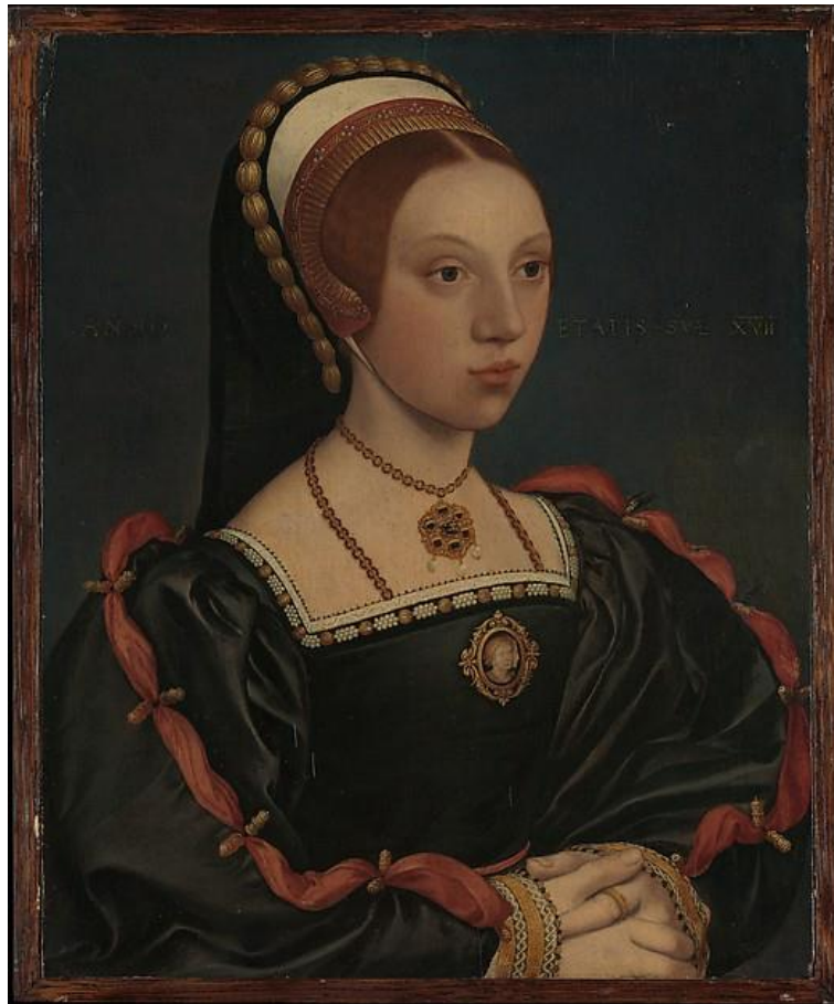
Fig 6 Portrait of a young woman , c.1540-45, workshop of Hans Holbein

A young woman in her 17 th year; Portrait of a Young Woman , c.1540-45 from the workshop of Hans Holbein at the Metropolitan Museum of Art, New York (ref. 49.7.30 );