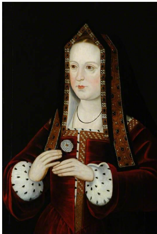
Fig 20 Elizabeth of York, unknown artist

Note the pattern on the jewelled band on her hood: squares comprising four pearls, (perhaps representing a four-leaf clover), alternating with gemstones set in gold on Elizabeth of York's hood. (figs 19, 20)