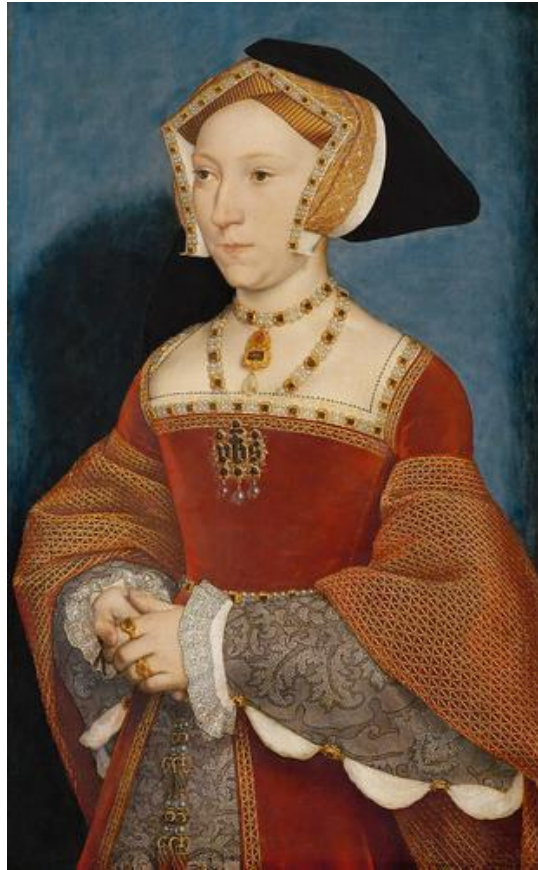
Fig 26 Jane Seymour, 1536, Hans Holbein, Kunsthistorisches Museum, Vienna

Jane Seymour has the same band on her hood and the matching necklace. (fig 26). She is also wearing the same pendant containing a ruby and a table cut emerald (fig 27) as Katherine Howard. (figs 13, 18)