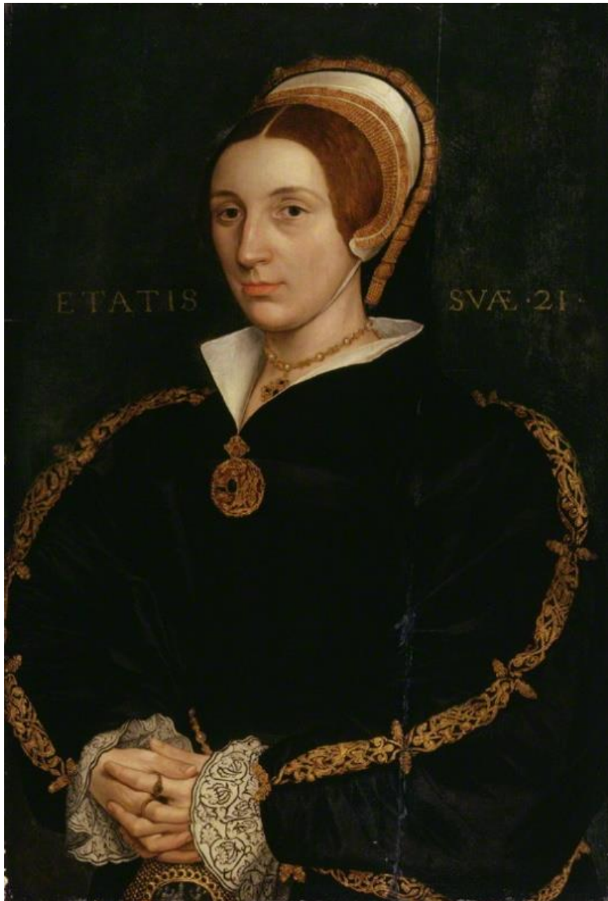
Fig 10 Unknown woman, formerly known as Catherine Howard, after Hans Holbein, late 17th century