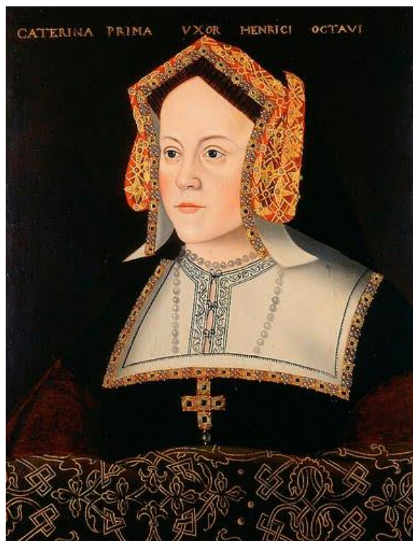
Fig 22 Katherine of Aragon, unknown artist

Note the same jewelled band on Katherine of Aragon's Hood (fig 21) and hood and jewelled band on the neckline. (fig 22)