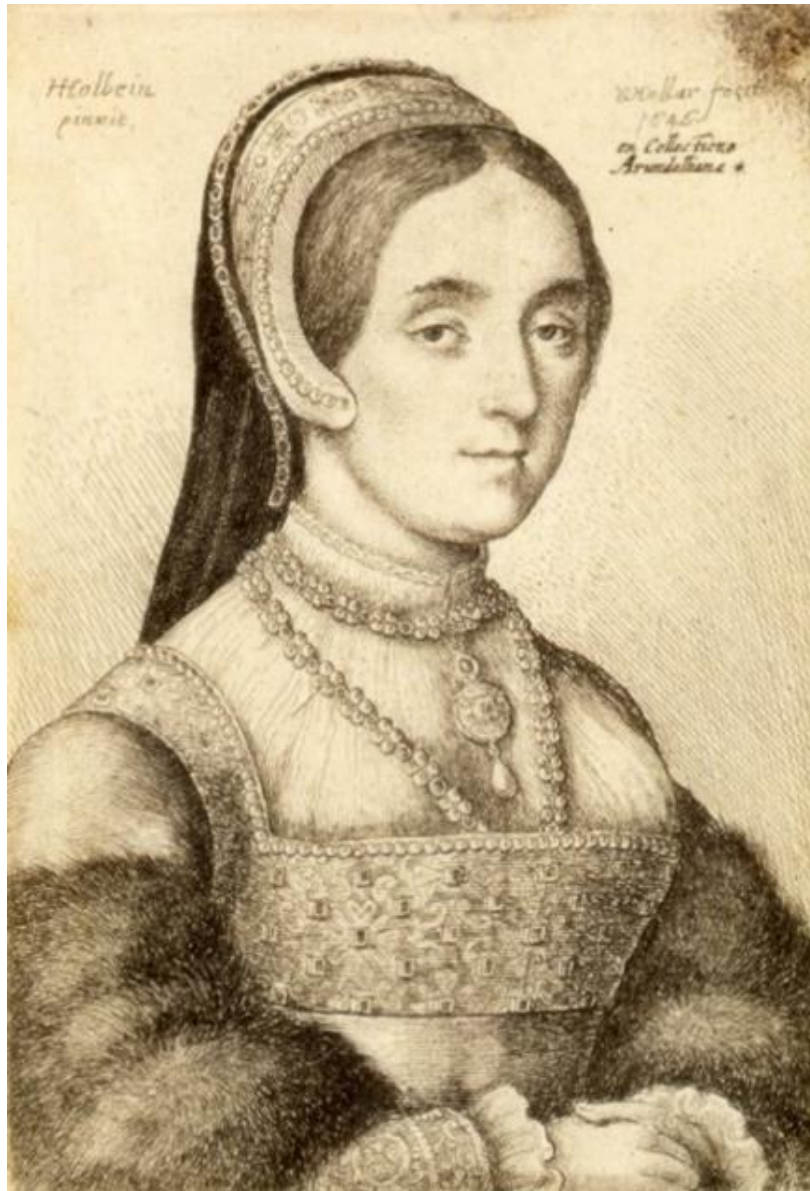
Fig 14 Catherine Howard (?) 1646, Wenceslas Hollar