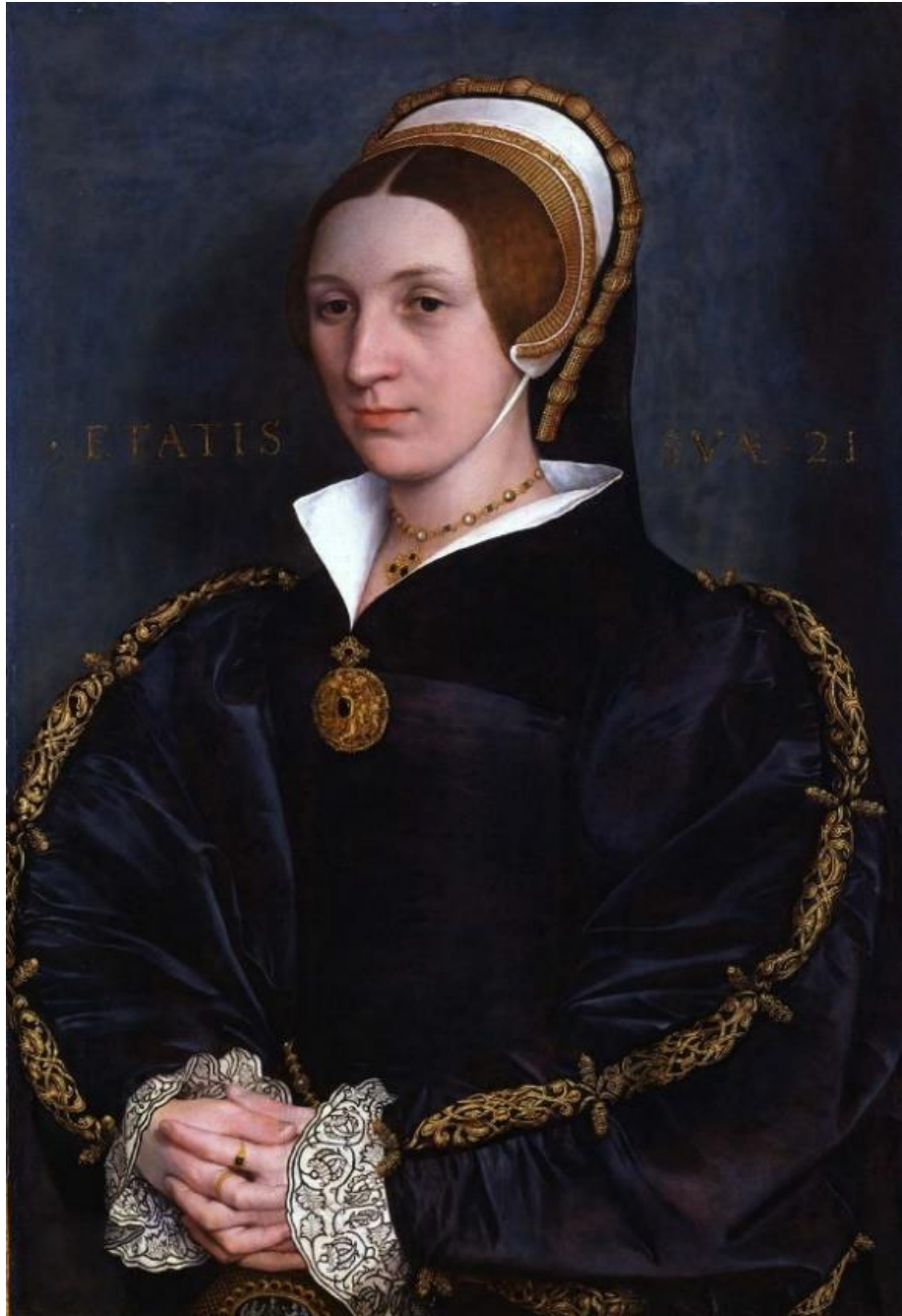
Fig 7 Unknown lady, probably a member of the Cromwell family, c.1540, Hans Holbein