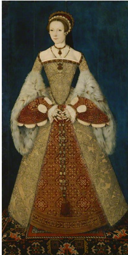
Fig 29 Queen Katherine Parr, The Glendon Hall Portrait, c.1545, attributed to Master John