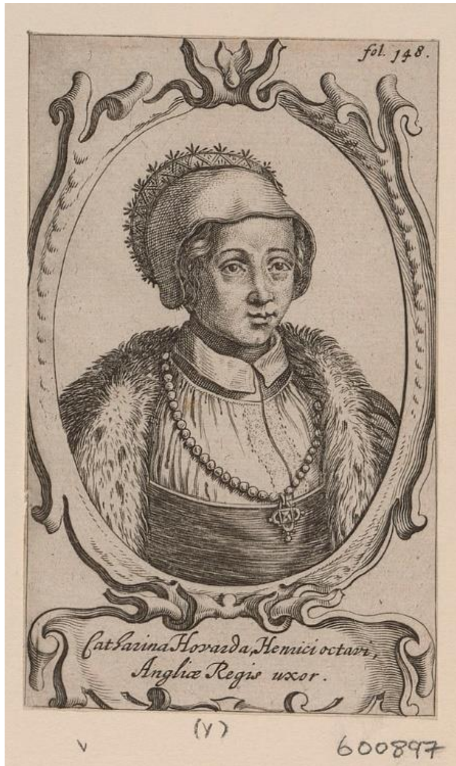
Fig 17 Catherine Howard, unknown artist, 17 th century?