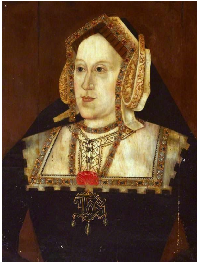
Fig 23 Katherine of Aragon, unknown artist

In this unflattering portrait, Katherine of Aragon is wearing a jewelled band in the same design as Elizabeth of York on her hood with a matching necklace (four pearls, alternating with diamonds and rubies set in gold). (fig 23)