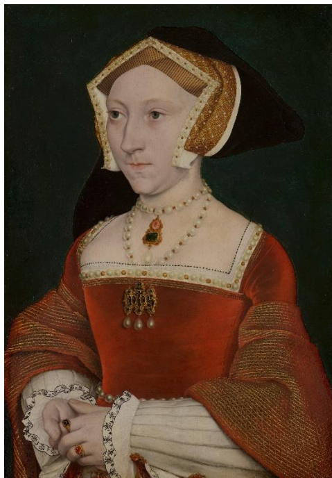
Fig 27 Jane Seymour, c.1540, studio of Hans Holbein. Mauritshuis, The Hague

Jane Seymour has the same band on her hood and the matching necklace. (fig 26). She is also wearing the same pendant containing a ruby and a table cut emerald (fig 27) as Katherine Howard. (figs 13, 18)