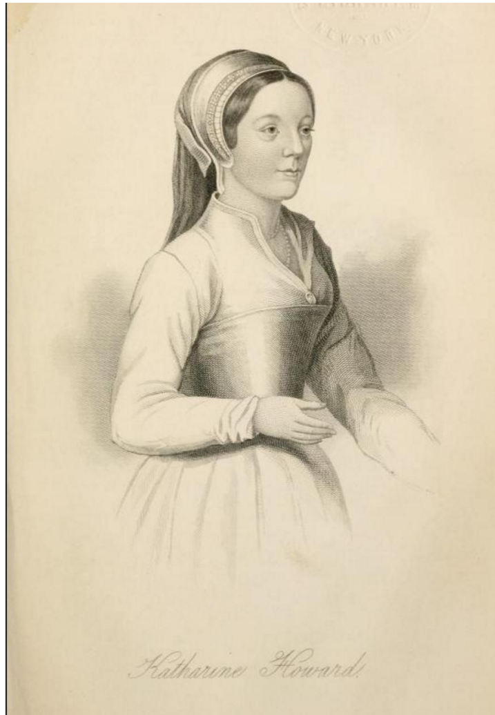
Fig 5 Katherine Howard, G. P. Harding, published 1854