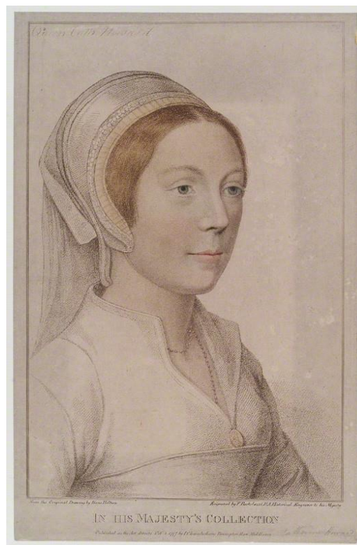
Fig 4 Unknown woman engraved as Catherine Howard, 1797, Francesco Bartolozzi, 1797, NPG D20279

By the 19th century a drawing by Hans Holbein in the Royal Collection (ref. RCIN 912218 ), (fig 3) a later version of the drawing by Francesco Bartolozzi (ref. RCIN 680431 ) (fig 4) and a miniature portrait by Henry Pierce Bone that was based on these drawings were thought to depict Queen Katherine.