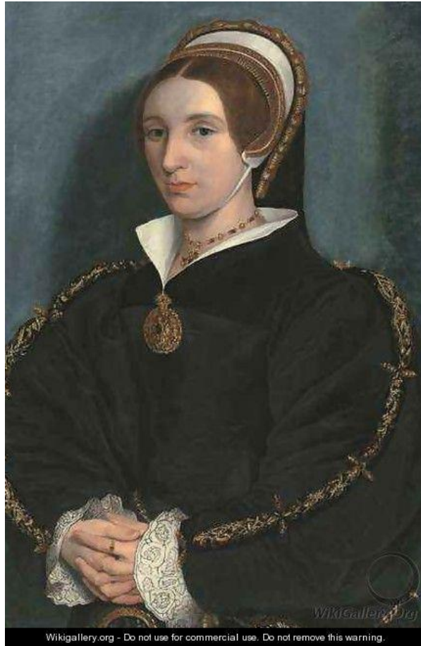
Fig 8 Portrait of a lady, possibly Catherine Howard

A miniature portrait based on the Hever portrait. (fig 8)