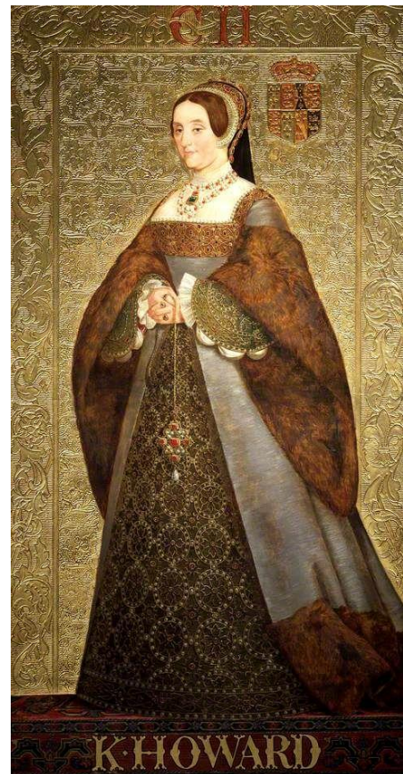
Fig 2 Katherine Howard, Richard Burchett (1815-1875) (circle of)

We don't have much to go on as far as Katherine Howard's physical appearance: she was a pretty, petite, and slender young lady who became a little plump as Queen, or at least while she was in captivity and unable to take any exercise.